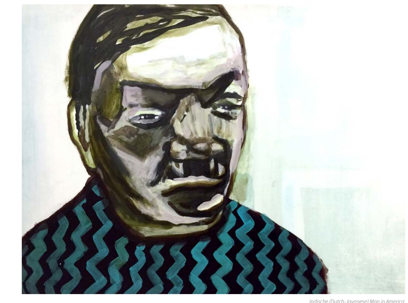
Ink, Goauche, and Watercolor on Paper, 20 x 30 inches

Elsie B. Rosefsky Memorial Art Gallery Fine Arts Building, Room 259 Binghamton University